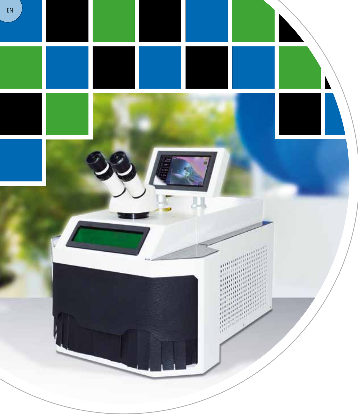
Laser Welder SL10 from Siro Lasertec