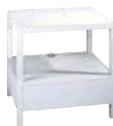
Table with integrated water tank and pump REF 090-606-00

The circulating cooling water makes it possible to operate the casting machine without an exterior water supply. At the same time the height of the table guarantees optimal working conditions.